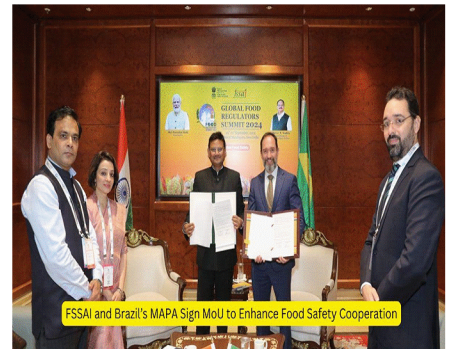
FSSAI and Brazil's MAPA Sign MoU to Enhance Food Safety Cooperation

(A) Recently the Food Safety and Standards Authority of India has signed a Memorandum of Understanding with the Ministry of Agriculture and Livestock of Brazil. The aim of this collaboration is to strengthen food safety measures and promote bilateral cooperation in this field. This MoU will facilitate joint projects and technical cooperation between FSSAI and MAPA.